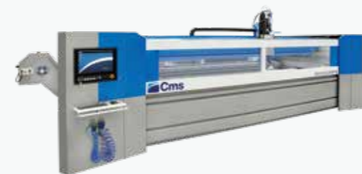
TECNO CUT PROLINE