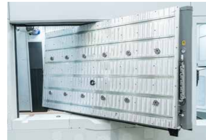
WORKING TABLE Customized working table in accordance with customers' specific needs (Zero-Point, Vacuum, T-Slots..etc.)