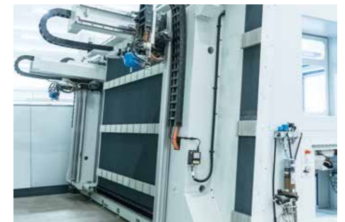
FULL ENCLOSURE Full Enclosure with rear bellows