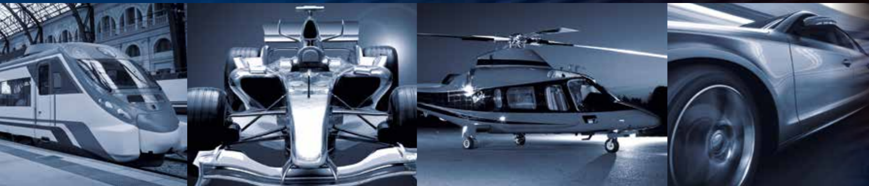
aerospace | trains | automotive | aeronautics