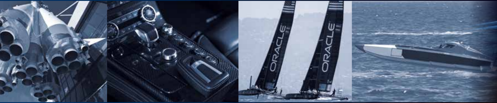
carbon fiber components | aluminum parts | F1 & automotive