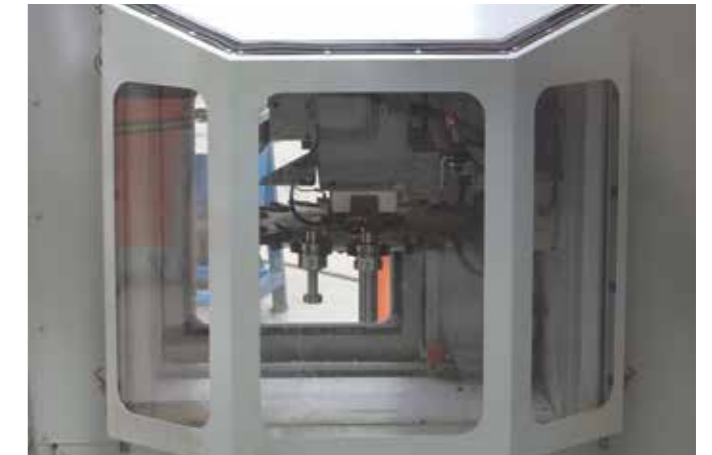
TOOL CHANGER MAGAZINE Safe access and protection from dust