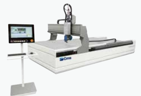
TECNO CUT SMARTLINE