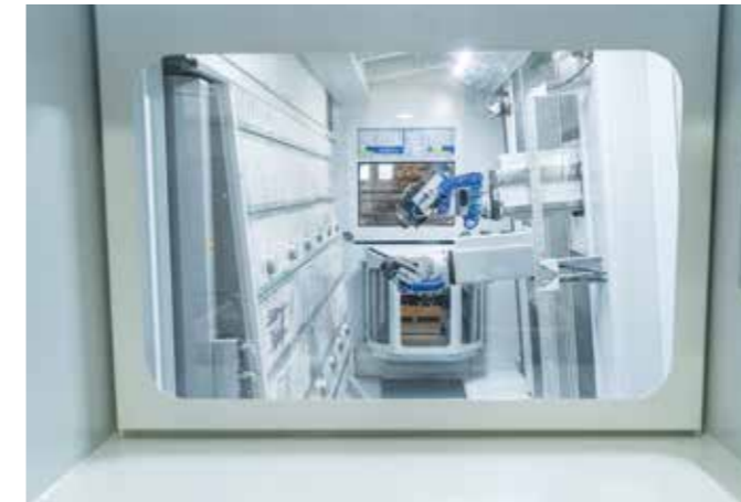
OPERATOR'S WORKSTATION Complete inner view by the operator