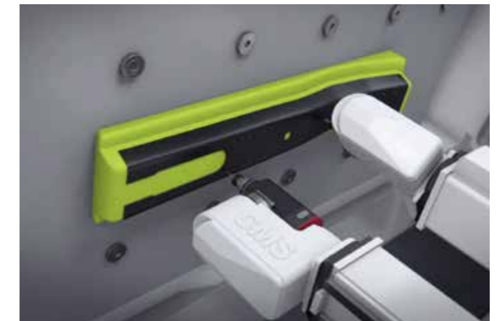
DOUBLE OPERATING UNITS Simultaneous machining with two operating units