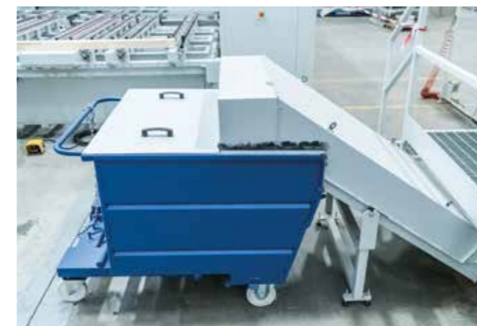
CHIP CONVEYOR Easy removal of scraps and dust